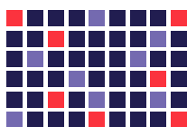
Stock of CVEs within your organisation

50+ connectors to orchestrate your tools: unification, speed and precision.