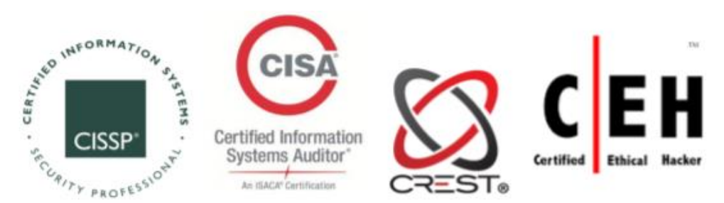
Figure 1: Personnel Security Certifications